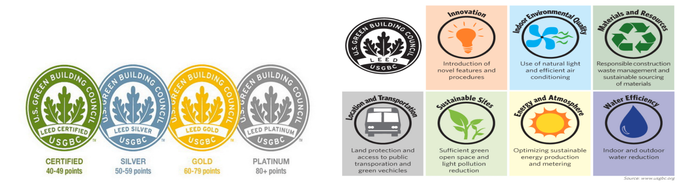
Fig No:1 U.S. Green Building Council

LEED is a national certification system developed by the U.S. Green Building Council (USGBC) to encourage the construction of energy and resource-efficient buildings that are healthy to live in. LEED stands for Leadership in Energy and Environmental Design. USGBC established LEED as a way to define and measure "green buildings." This is a voluntary, market driven building rating system based on existing proven technology. After the pilot launch in 1998 for LEED New Construction, LEED Existing Buildings, LEED for Commercial Interiors and LEED for Core and Shell.