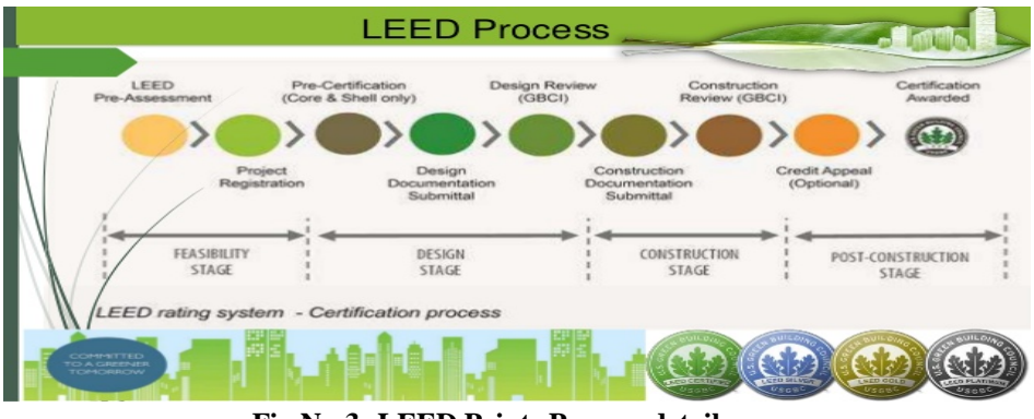
Fig No-3: LEED Points Process details

Leadership in Energy and Environmental Design (LEED), which has played an important role in spreading the green building certificate system approach worldwide, aims to reduce negative environmental effects of buildings and ensure energy efficiency. To be successful, a green building project is expected to cost less than what it brings during the lifetime of the building. We will estimate the extra constructions costs required to have two buildings in Tamil Nadu LEED-certified.